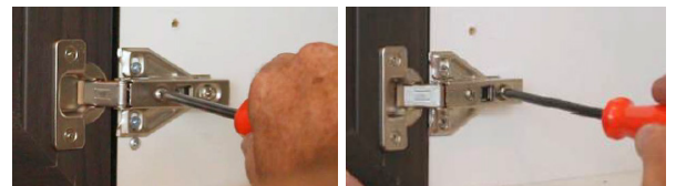
Front screw adjusts right and left. Back screw adjusts in and out.