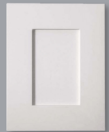
Paint Ready Shaker Classic