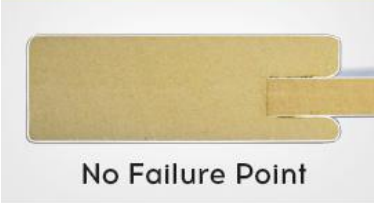
No Failure Point

Our DuraLuxe doors are superior products designed to eliminate failure points.