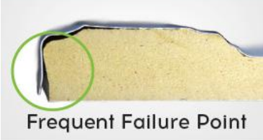
Frequent Failure Point